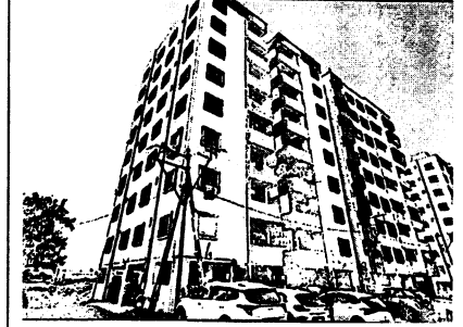
PHOTO OF THE PROPERTY

Property Details:EMT of Residential Flat No. 604 having built up area 52.96 Sq. Mtrs. situated on the Sixth Floor, WING-L4, CERAMIC CITY ,apartment standing on Plot No. 68, 69 and 70, totally admeasuring 1104.67 SqMtrs of Non – Agriculture land , Revenue Survey No. 47 , situated at Village- Trajpar of MorbiTaluka of Morbi District of Gujarat.